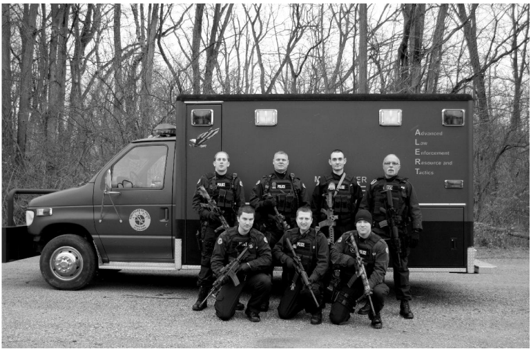
December 2016 Training

The mission of the ALERT team is to support and augment the Montpelier Police Department with a more advanced response to critical or higher-risk incidents, and help reduce the risk of injury to innocent citizens, police officers, and suspects. The ALERT Team shall operate with a lawful purpose, within the scope of the laws of Montpelier and State of Ohio, ensuring that all persons are afforded their rights given to them under the Constitution of the United States.